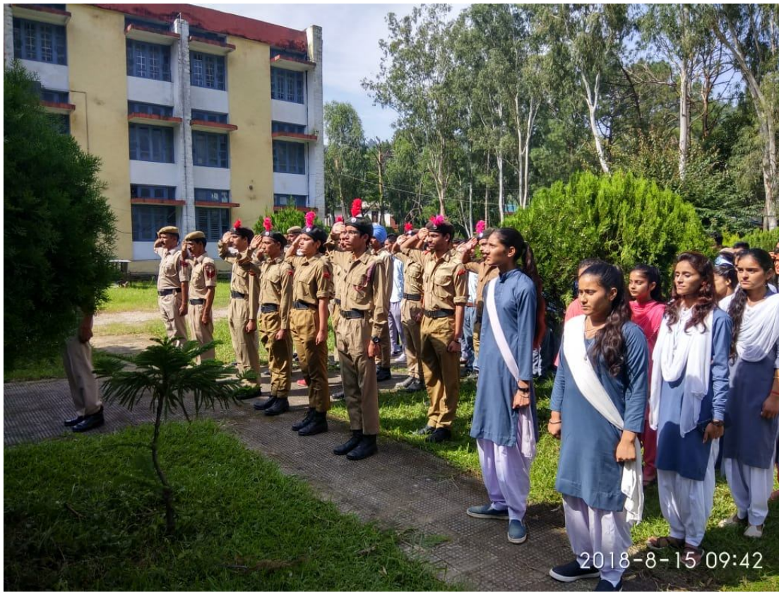
❖ Students during ANNUAL INTER-COLLEGE SPORTS' MEET